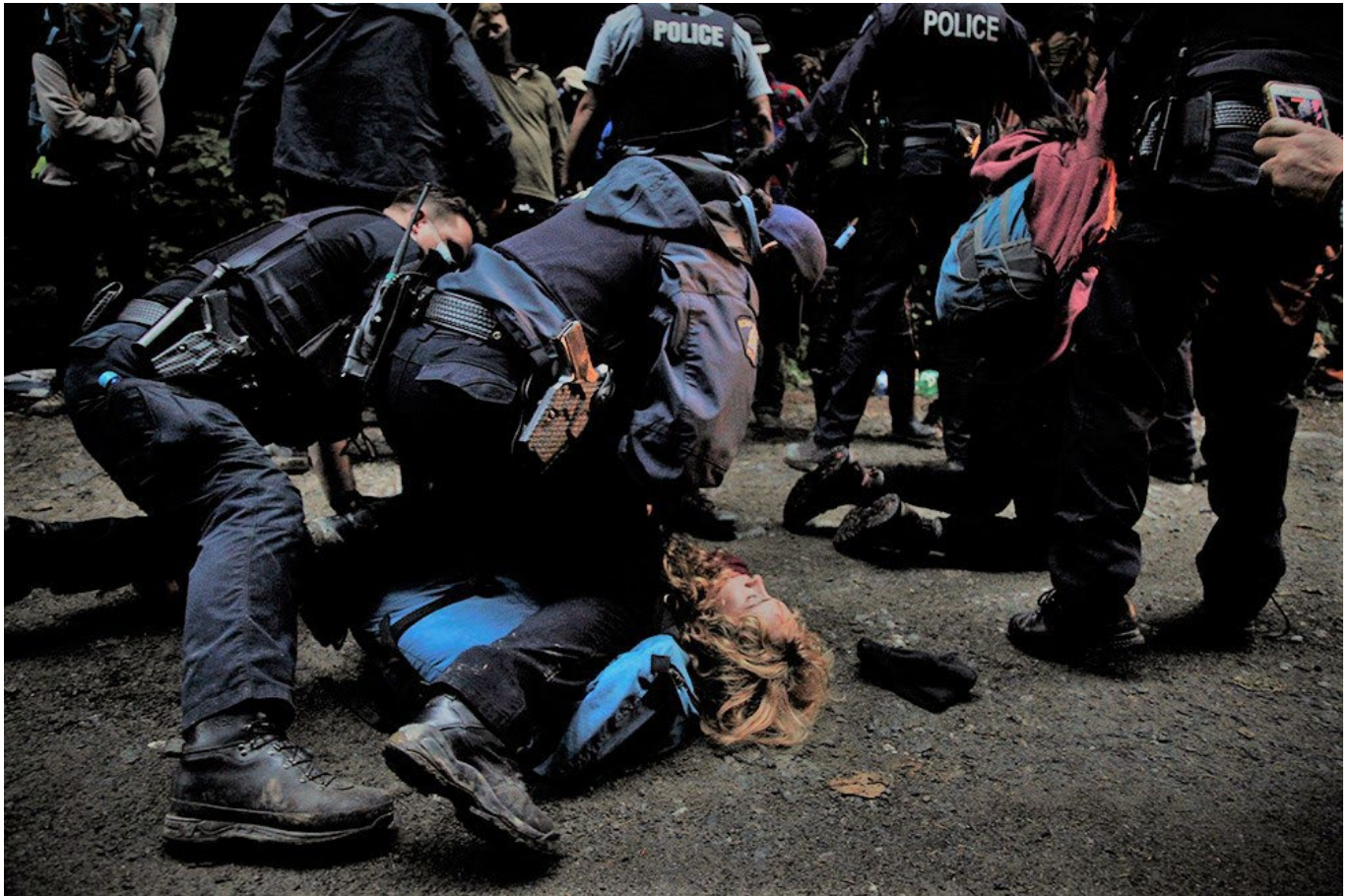
Photo of an arrest at Fairy Creek illustrating the type of extreme RCMP conduct that attracted the Court's criticism.

There are now a total of 50 Court decisions, from the BC Supreme Court, BC Court of Appeal, and Supreme Court of Canada decisions on the Fairy Creek protests. As one of the most important protests in our history, they make a fascinating though discouraging read.