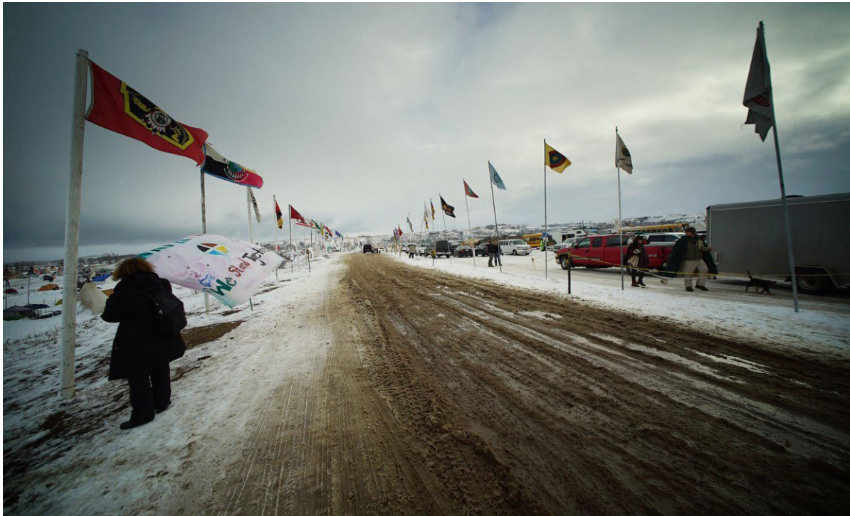
The oil pipeline protest site by the Standing Rock Reservation in North Dakota in November, 2016

On March 12, 2004, five women representatives from the British Columbia Coalition of Women's Centres were arrested because they refused to leave the legislative building. The five women were protesting the Campbell government's cuts to the province's Women's Centres. They were charged by police with "assault by trespass" under the now repealed Section 41(2) of the Criminal Code . The Crown Attorney refused to proceed with the charge. This is not surprising given the protesters went limp and did not physically resist being removed.