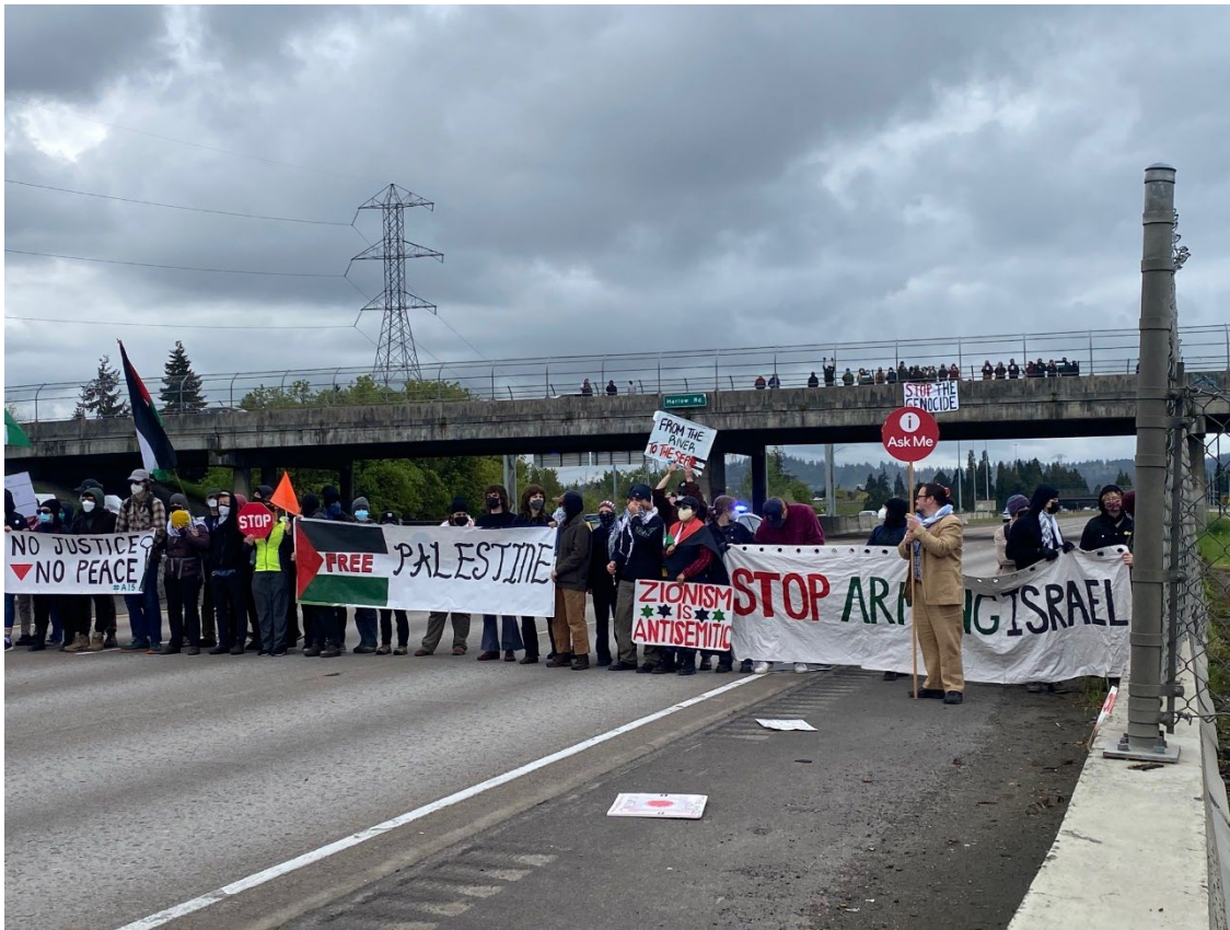
Free Palestine protestors on the I-5 in Eugene Oregon on April 15, 2024 as part of the global A15action blockades.

https://ici.radio-canada.ca/rci/en/news/2072993/quebec-superior-court-judge-rejects-mcgill-injunction-request-to-remove-encampment