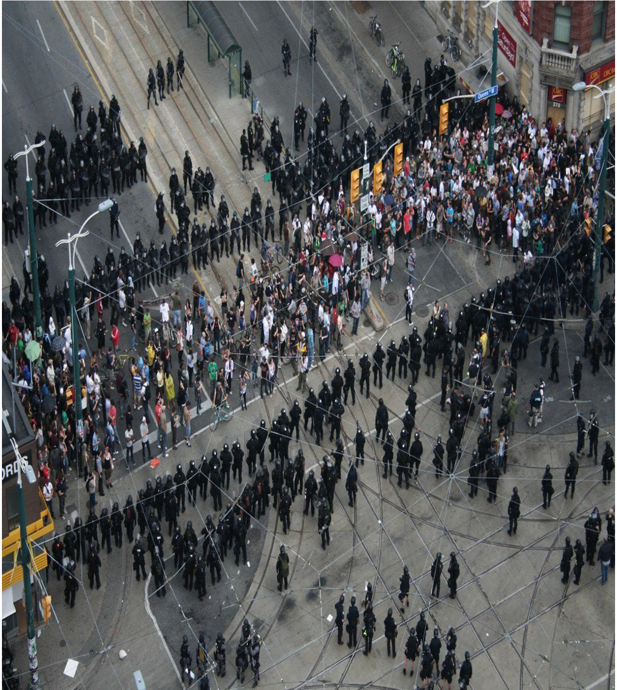
Kettling by riot police at Queen and Spadina during Toronto G20: 17 June 2010