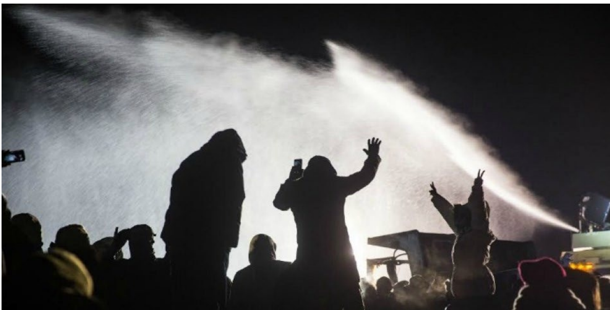
Fire hoses deployed on water protectors at the Dakota Access Pipeline protest.

On November 20, 2016 at a standoff near the Standing Rock encampment that lasted for more than six hours, police sprayed a crowd of roughly 400 protesters with water in temperatures hovering below freezing (photo below). Camp medics reported that hundreds were treated for hypothermia. Twenty-six people were hospitalized. National Lawyers Guild observers reported that several people were unconscious and bleeding after being shot by rubber bullets.