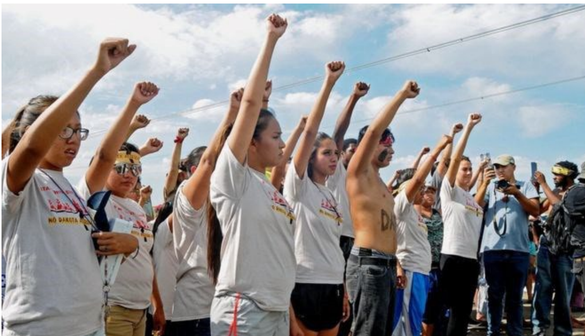
A group of Native American protesters halt work on the Dakota Access Pipeline North Dakota on August 16, 2016.

The Criminal Code referred to in this Guide is accessible through the Department of Justice website, at Criminal Code (justice.gc.ca) .