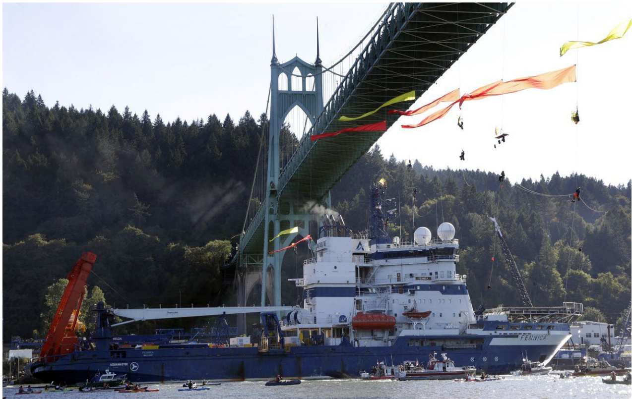
Greenpeace Protesters use Kayaks to encircle Greenpeace Activists Hanging from St. John's Bridge over the Willamette River, Portland, Oregon, to protest the departure of the Shell icebreaker Fennica en route to Alaska for Arctic Drilling, July 30, 2015.

Masters also have limited authority to lawfully detain, put people under custody, and even use force in in order to ensure the safety of a vessel and passengers. This is a power that can potentially be used against protesters who endanger vessels.