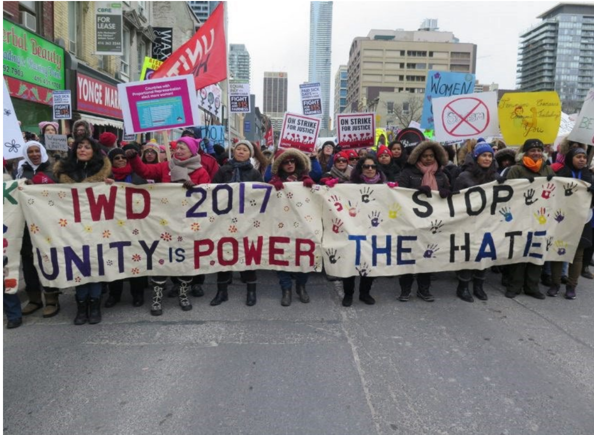
Women's Day Protest, Toronto, March 11, 2017

What we are witnessing, and participating in, is what has been described as an age of protest. People who are used to exercising their democratic rights once every 4 years in the ballot box are beginning to realize that is no longer adequate in the age of arrogant plutocrats like President Trump.