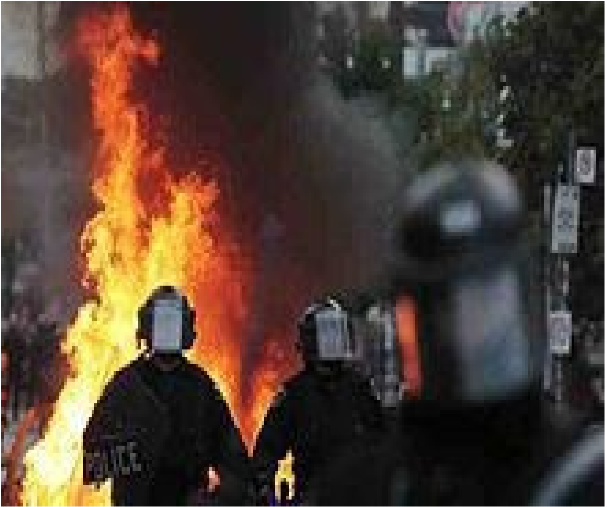
G-20 Bloc/police provoked riot – police in front of burning police vehicle, Toronto, June 26-27, 2010

This was the conduct engaged in and filmed in the G20 demonstration, which had been peaceful. A small number of black clad protesters – perhaps 100 – separated from the crowd and began torching police cars and then smashing windows. Then they removed their black outer clothing and blended in with the crowd of peaceful protesters. Some speculated that, as in the Montebello illustration, these violent demonstrators were agent provocateurs whose task it was to discredit the peaceful protesters and their objectives. The filmmaker – Joe Wenkoff - speculated that it was odd considering the 1.5 billion dollars spent on security, and the presence of approximately 20,000 police officers in the general area of the demonstration, that there wasn't a single police officer within blocks of the violence, which took place in one of the prime business areas in downtown Toronto and an area easily anticipated to be a magnet for this kind of violent demonstrator.