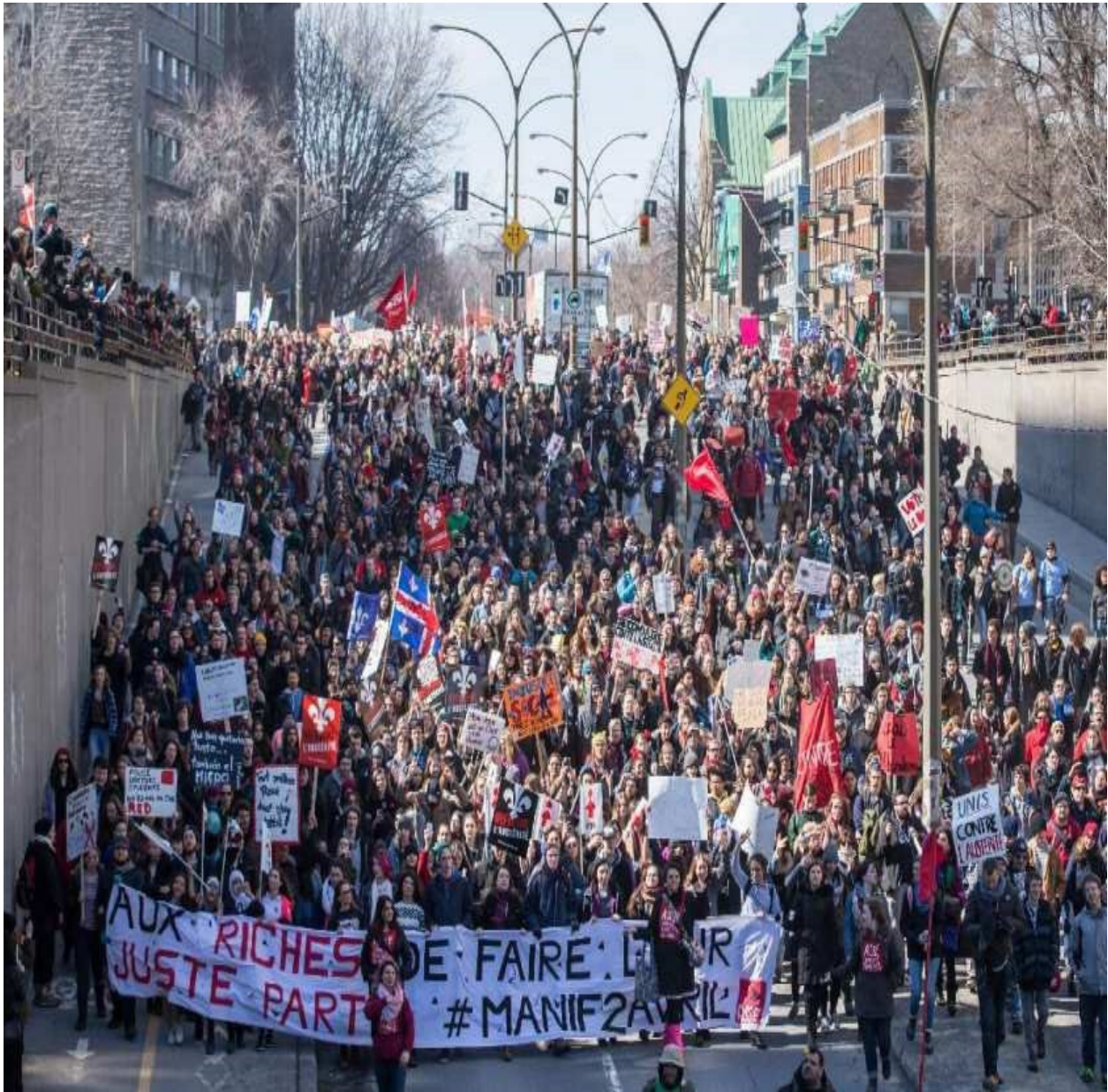
An anti-austerity demonstration in Montreal on Thursday, April 2, 2015.