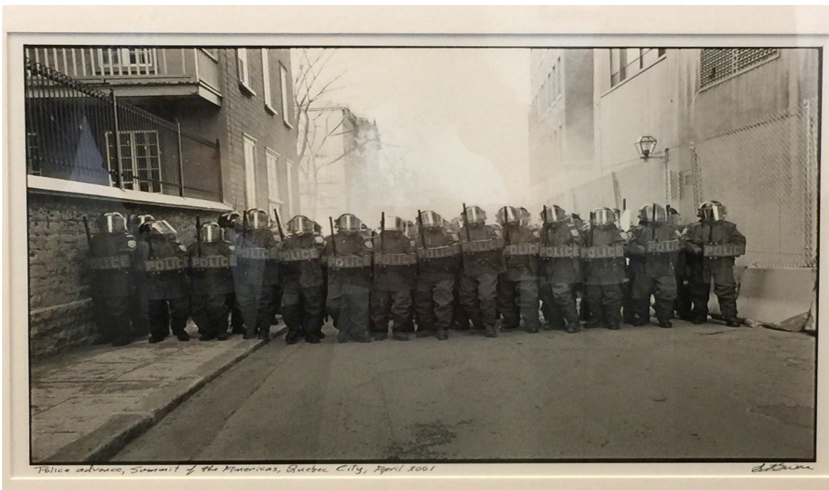
Police advance, Summit of the Americas, Quebec City, April 2001