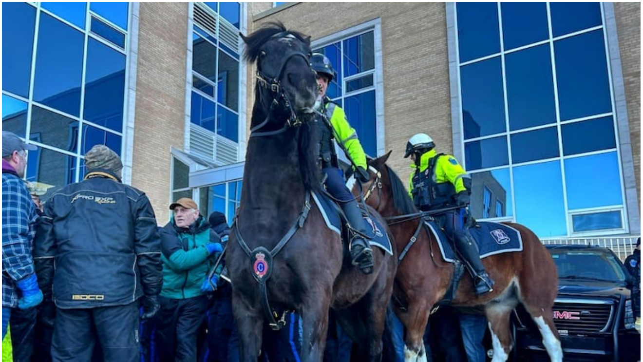
Armed with injunction against harvesters, Furey hopes to push delayed budget forward | CBC News

A fisheries protest at a Newfoundland and Labrador government building turned violent, delaying the budget and sending at least two people to hospital. The fish harvesters, members of the Fish Food and Allied Workers Union, want the provincial government to allow them to sell their catch to buyers outside the province rather than locally at a preset price. March 29, 2024