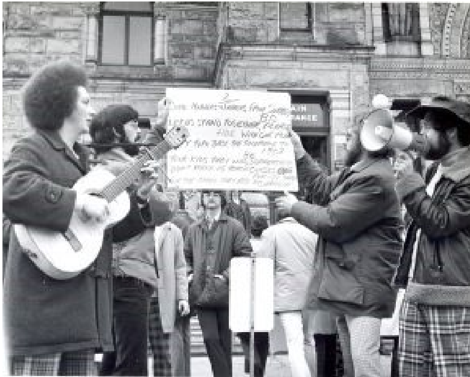
Surrey teachers protest class size and under-funding at the legislature, February 15, 1974.